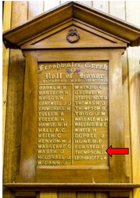
Freshwater Creek Honour Board